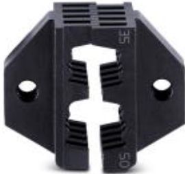
Spare die, for CRIMPFOX 50R

Please be informed that the data shown in this PDF Document is generated from our Online Catalog. Please find the complete data in the user's documentation. Our General Terms of Use for Downloads are valid ( http://download.phoenixcontact.com )