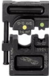
Die, for Crimpfox-M, for insulated cable lugs 0.1 - 0.4 mm 2 and 4 - 6 mm 2 (light green, yellow), packed in a serial storage box

Please be informed that the data shown in this PDF Document is generated from our Online Catalog. Please find the complete data in the user's documentation. Our General Terms of Use for Downloads are valid ( http://download.phoenixcontact.com )