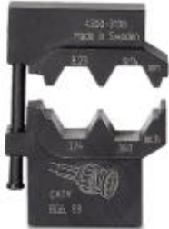
Die, for Crimpfox-M, for coaxial connectors: CATV RG 6,59, packed in a serial storage box

Please be informed that the data shown in this PDF Document is generated from our Online Catalog. Please find the complete data in the user's documentation. Our General Terms of Use for Downloads are valid ( http://download.phoenixcontact.com )