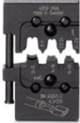
Die, for Crimpfox-M, for non-insulated slip-on sleeves 0.5 - 6 mm 2 , packed in a serial storage box

Please be informed that the data shown in this PDF Document is generated from our Online Catalog. Please find the complete data in the user's documentation. Our General Terms of Use for Downloads are valid ( http://download.phoenixcontact.com )