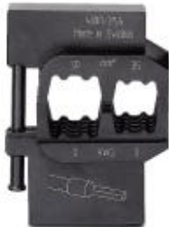
Die, for Crimpfox-M, for ferrules 35 - 50 mm 2 , packed in a serial storage box

Please be informed that the data shown in this PDF Document is generated from our Online Catalog. Please find the complete data in the user's documentation. Our General Terms of Use for Downloads are valid ( http://download.phoenixcontact.com )