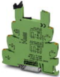
6.2 mm PLC basic terminal blocks with Push-in connection, 24 V DC input voltage (without relay or optocoupler)

Please be informed that the data shown in this PDF Document is generated from our Online Catalog. Please find the complete data in the user's documentation. Our General Terms of Use for Downloads are valid ( http://download.phoenixcontact.com )