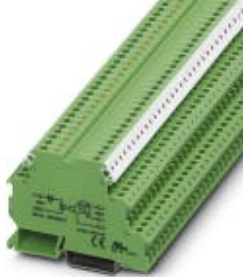
Power solid-state relay terminal block, input: DC voltage, output: DC voltage, input voltage: 5 V DC

Please be informed that the data shown in this PDF Document is generated from our Online Catalog. Please find the complete data in the user's documentation. Our General Terms of Use for Downloads are valid ( http://download.phoenixcontact.com )