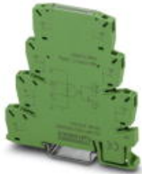
6.2 mm PLC solid-state relay with Push-in connection for railway applications, input voltage: 110 V DC, input voltage range from 0.7 \times U_N to 1.25 \times U_N , temperature range from -25^\circ\text{C} to +70^\circ\text{C}

Please be informed that the data shown in this PDF Document is generated from our Online Catalog. Please find the complete data in the user's documentation. Our General Terms of Use for Downloads are valid ( http://download.phoenixcontact.com )