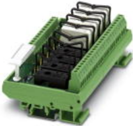
VARIOFACE module, for 8 plug-in miniature relays or miniature optocouplers, with LED, 24 V DC input voltage

Please be informed that the data shown in this PDF Document is generated from our Online Catalog. Please find the complete data in the user's documentation. Our General Terms of Use for Downloads are valid ( http://download.phoenixcontact.com )