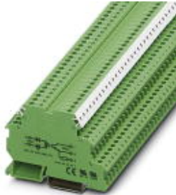
Input solid-state relay terminal block, input: 12 V DC, output: 3 - 48 V DC/100 mA, terminal block width: 6.2 mm

Please be informed that the data shown in this PDF Document is generated from our Online Catalog. Please find the complete data in the user's documentation. Our General Terms of Use for Downloads are valid ( http://download.phoenixcontact.com )