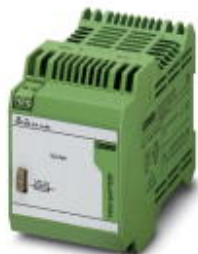
Power storage device, lead AGM, VRLA technology, 12 V DC, 1.6 Ah.

Please be informed that the data shown in this PDF Document is generated from our Online Catalog. Please find the complete data in the user's documentation. Our General Terms of Use for Downloads are valid ( http://download.phoenixcontact.com )