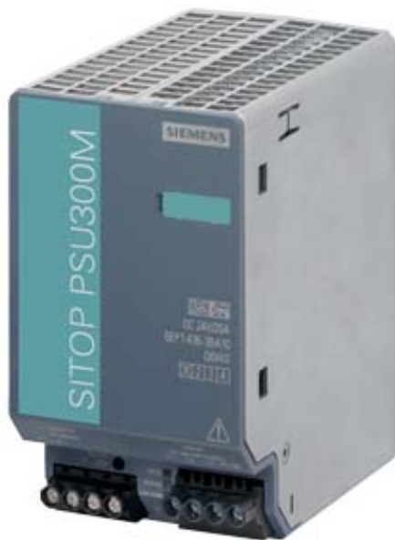
SITOP PSU300M 20 A STABILIZED POWER SUPPLY INPUT: 400-500 V 3 AC OUTPUT: 24 V DC/20 A