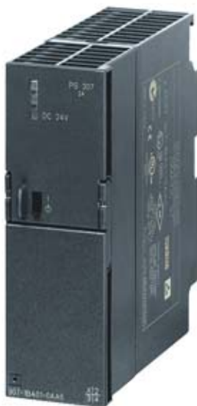
SIMATIC S7-300 STABILIZED POWER SUPPLY PS307 INPUT: 120/230 V AC OUTPUT: DC 24 V DC/2 A