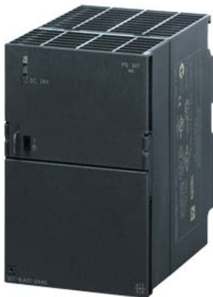
SIMATIC S7-300 STABILIZED POWER SUPPLY PS307 INPUT: 120/230 V AC OUTPUT: DC 24 V DC/10 A