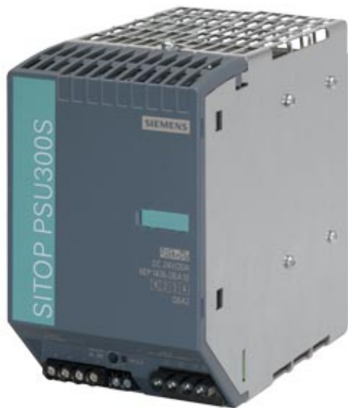
SITOP PSU300S 20 A STABILIZED POWER SUPPLY INPUT: 400-500 V 3 AC OUTPUT: 24 V DC/20 A