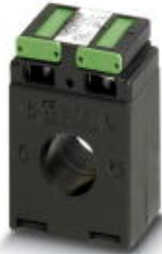
Bus-bar current transformer, 150 A AC primary current; 5 A AC secondary current; accuracy class 1; 5 VA rated power

Please be informed that the data shown in this PDF Document is generated from our Online Catalog. Please find the complete data in the user's documentation. Our General Terms of Use for Downloads are valid ( http://download.phoenixcontact.com )