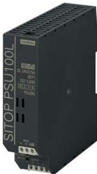
SITOP PSU100L 24 V/2.5 A STABILIZED POWER SUPPLY INPUT: 120/230 V AC OUTPUT: 24 V/2.5 A DC