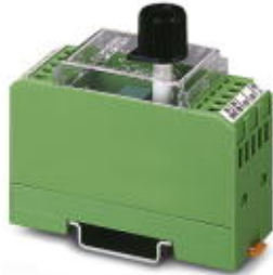
Setpoint value potentiometer, to set setpoints individually, resistance value 4,7 kΩ

Please be informed that the data shown in this PDF Document is generated from our Online Catalog. Please find the complete data in the user's documentation. Our General Terms of Use for Downloads are valid ( http://download.phoenixcontact.com )