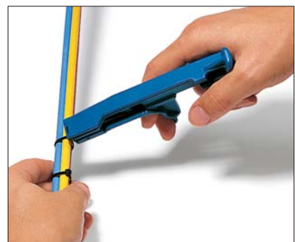
Twist to cut.