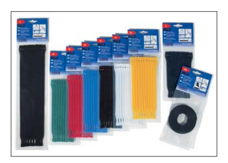
The TEXTIE-Series is available in different colours and lengths.