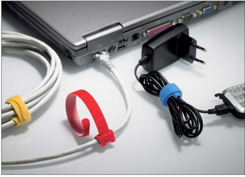
Due to the functional cable tie design the TEXTIE is fixed on the cable and can't get lost.