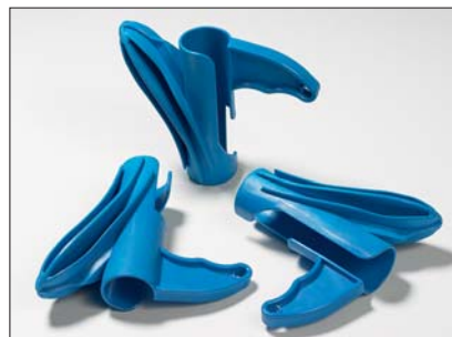
Applicator tools HAT are available for every Helawrap cover size.

The new Helawrap applicator tool enables the user to bundle cable rapidly and effortlessly. The applicator tool has been optimised to glide smoothly through the cover and allows easy insertion of cable into Helawrap. The unique design also allows individual cables to be removed from the applicator tool and branched off through the cover apertures. A tool is included with every Helawrap package. Additional tools can be purchased separately.