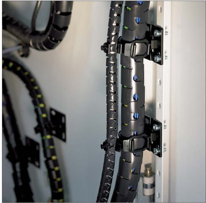
Protecting and fixing cables with the Helawrap cable cover and accessory set, for instance in wiring cabinets.