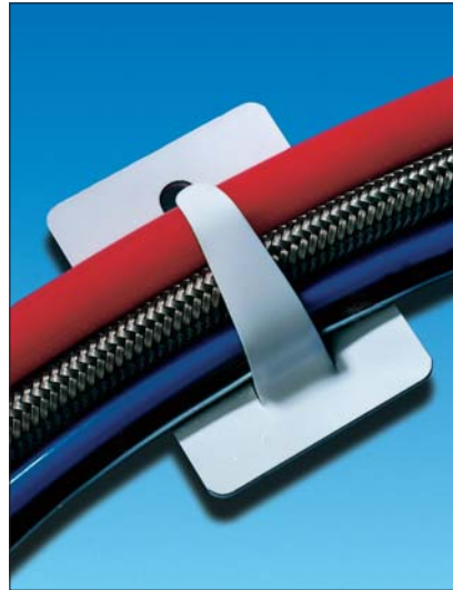
Malleable tongue allows for a variety of sizes per clip.

These clips are ideal for use in applications which are difficult to access, or for areas where self adhesive is the only possible fixing method (for example 'holes' would be unacceptable). Typically applications include domestic appliances and trailers.