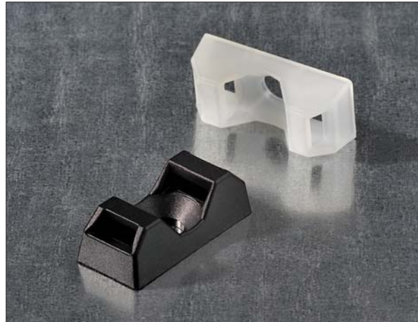
Q-mount, CTQM 2-way entry, screwable.

The Q-mount offers a perfect solution in combination with the Q-tie cable ties. It keeps the inserted cable tie in place during pre-assembly and ensures that the Q-tie does not slip out even in difficult situations, for example vertical mounting positions.