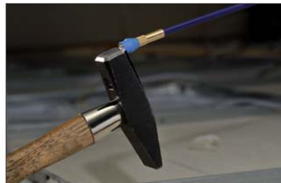
The strong magnet lifts a metallic tool of up to 2.5 kg.