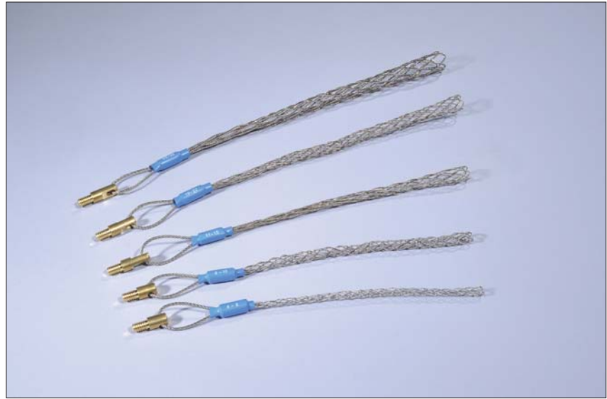
Cable Grips are available in five different sizes to attach a wide range of cable diameters.

Cable Grips are designed to grip objects from the outside and provide a very reliable super fast method for securing pipes and cables to the rods. Just open a grip by compressing the braided sleeving, push it over a cable and let go, the material will contract immediately and establish a tight fastening of the cable to the tool.