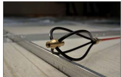
The whisk allows the rod to glide over obstructions easily.