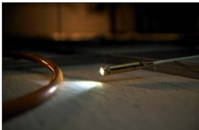
The Rod Set Beam - a perfect tool for seeing into cavities.