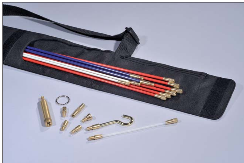
All components stored neat and tidy with the Rod Set Deluxe.

The Rod Sets are a professional cable installation tool which enables installation jobs to be done in record time even in the most challenging environments. Rods made of glass reinforced plastic (GRP) are able to pull a cable weight of up to 80 kg. The product also allows its user to inspect, illuminate and retrieve. The complete system integrates rods, a variety of useful attachments and a bag to store all parts in one place.