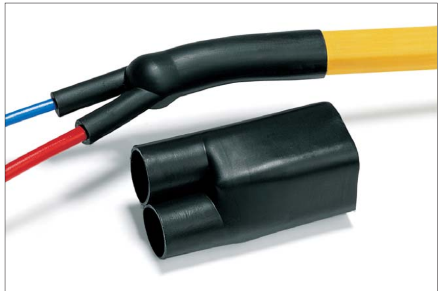
HEV breakout boot for two-core cable.

Cable breakouts are supplied with an adhesive inner coating for reliable environmental sealing, and are available for 2, 3, 4, 5 and 6 core cables.