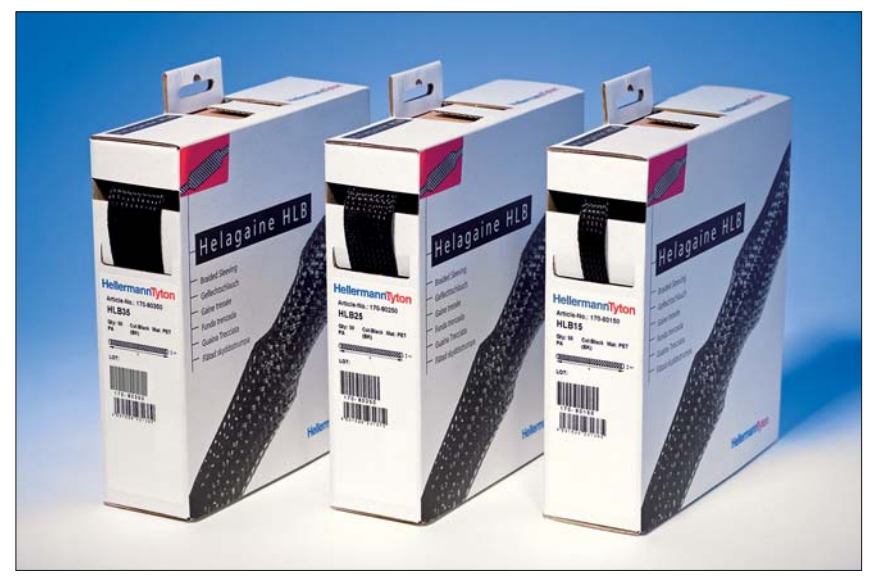
Helagaine HLB: The expansion rate makes it possible. Only three sizes in a handy dispenser box for almost all standard diameters.

Helagaine HLB is supplied in practical dispenser boxes and covers a wide range of applications with only a few sizes. It is ideal for both the professional and the home user. Helagaine HLB bundles and effectively protects cables and wires, for instance in HiFi systems and in industrial plants. Helagaine HLB also provides good resistance to abrasion.