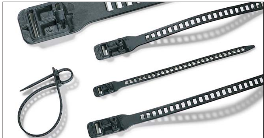
The Elasticity of the SOFTFIX ties makes them suitable for use in many applications.

The SRT range offers solutions to numerous bundling applications. The soft, flexible material makes these ties particularly suitable for use on data and fibre-optic cables. The elasticity of the material makes them ideal for securing young trees to support poles, and other applications within the gardening and landscaping industry.