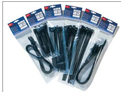
SOFTFIX ties available in small quantities.