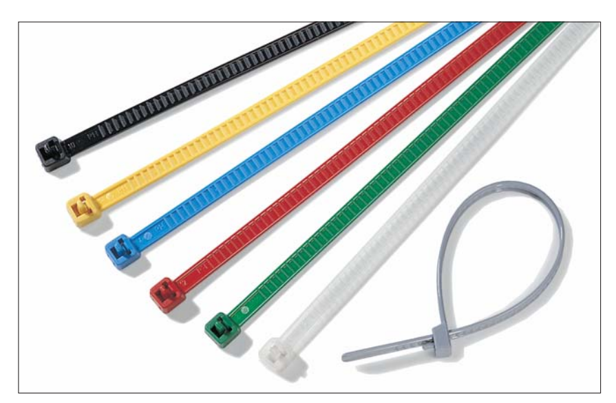
The LR55 cable ties are reuseable and ideal for colour coding.

These releasable and reusable ties are ideal where temporary installation or the addition or removal of cables is required, for example: logistic identification (colour coding), packaging industries, cable harness manufacturing.