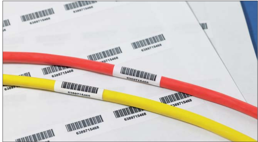
Laminating the mark gives long-term print survivability.