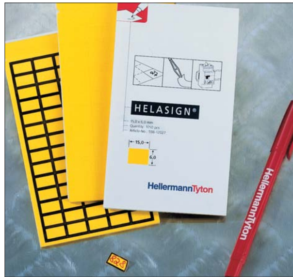
Always on hand: Labels in a convenient, pocket sized and lightweight booklet.

For professional hand inscriptions we recommend the T82 marker pen which has fast-drying and UV-resistant ink.