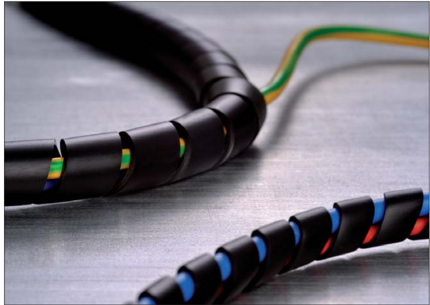
Spiral binding SBPAV0.

The use of SBPAV0 spiral binding is particularly suitable for challenging applications, for instance public buildings, the rail and aviation industry and wherever the requirements of UL94 V0 are demanded.