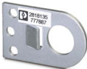
Tongue for attaching the CN-UB..., to housing panels, for example.

Please be informed that the data shown in this PDF Document is generated from our Online Catalog. Please find the complete data in the user's documentation. Our General Terms of Use for Downloads are valid ( http://download.phoenixcontact.com )