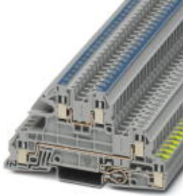
Installation level terminal block, Screw connection, Cross section: 0.2 mm 2 - 4 mm 2 , AWG: 24 - 12, Width: 5.2 mm, Color: gray, Mounting type: NS 35/7,5, NS 35/15

Please be informed that the data shown in this PDF Document is generated from our Online Catalog. Please find the complete data in the user's documentation. Our General Terms of Use for Downloads are valid ( http://download.phoenixcontact.com )