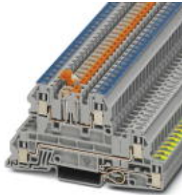
Installation level terminal block, Screw connection, Cross section: 0.2 mm 2 - 4 mm 2 , AWG: 24 - 12, Width: 5.2 mm, Color: gray, Mounting type: NS 35/7,5, NS 35/15

Please be informed that the data shown in this PDF Document is generated from our Online Catalog. Please find the complete data in the user's documentation. Our General Terms of Use for Downloads are valid ( http://download.phoenixcontact.com )