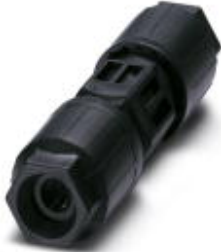
QUICKON cable connector, black, 4+PE-pos., 1.0 mm 2 ... 2.5 mm 2 / 690 V / 20 A, for 9 mm ... 16 mm cable diameter.

Please be informed that the data shown in this PDF Document is generated from our Online Catalog. Please find the complete data in the user's documentation. Our General Terms of Use for Downloads are valid ( http://download.phoenixcontact.com )