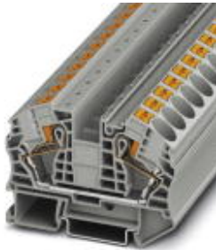
Feed-through terminal block, Connection method: Push-in connection, Cross section: 0.5 mm 2 - 25 mm 2 , AWG: 20 - 4, Width: 12.2 mm, Color: gray, Mounting type: NS 35/7,5, NS 35/15

Please be informed that the data shown in this PDF Document is generated from our Online Catalog. Please find the complete data in the user's documentation. Our General Terms of Use for Downloads are valid ( http://download.phoenixcontact.com )