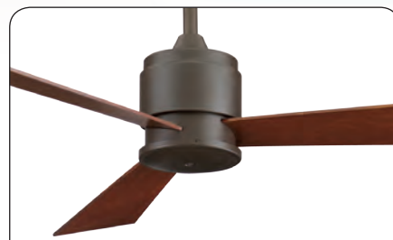
THE ZONIX OB #FP46200B, housing oil rubbed bronze, reversible blades cherry (showing)/walnut