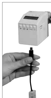
Figure 1: SPARmatic Zero

Connect the plug for the EUROtronic programming port (see illustration) to the relevant port on the energy-saving controller.