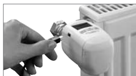
Figure 3: SPARmatic comet

On the display the following will appear "P 1". This symbolises "Room Profile 1". By turning the manual setting wheel (SPARmatic basic) or the keys [+] and [-] (SPARmatic Zero) you can select the room profile to be programmed for the controller. Only as many room profiles will be offered for selection as have actually been programmed in the software. By subsequently pressing the [PROG] key, the room profile is copied from the stick. After successful programming, the usual display will appear on the controller.