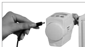
Figure 2: SPARmatic basic