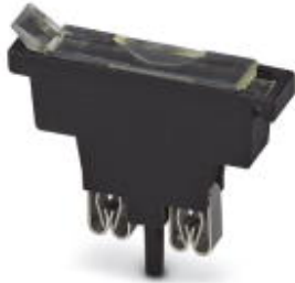
Fuse plug, Nominal current: 6.3 A, Length: 45.4 mm, Width: 9.9 mm, Color: black

Please be informed that the data shown in this PDF Document is generated from our Online Catalog. Please find the complete data in the user's documentation. Our General Terms of Use for Downloads are valid ( http://download.phoenixcontact.com )