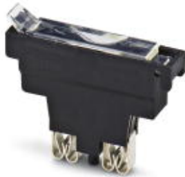
Fuse plug, Nominal current: 10 A, Length: 45.4 mm, Width: 9.9 mm, Color: black

Please be informed that the data shown in this PDF Document is generated from our Online Catalog. Please find the complete data in the user's documentation. Our General Terms of Use for Downloads are valid ( http://download.phoenixcontact.com )