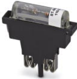
Fuse plug, Nominal current: 10 A, Length: 45.4 mm, Width: 9.9 mm, Color: black

Please be informed that the data shown in this PDF Document is generated from our Online Catalog. Please find the complete data in the user's documentation. Our General Terms of Use for Downloads are valid ( http://download.phoenixcontact.com )