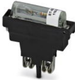
Fuse plug, Nominal current: 10 A, Length: 45.4 mm, Width: 9.9 mm, Color: black

Please be informed that the data shown in this PDF Document is generated from our Online Catalog. Please find the complete data in the user's documentation. Our General Terms of Use for Downloads are valid ( http://download.phoenixcontact.com )