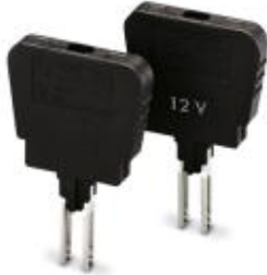
Fuse plug, Nominal current: 6.3 A, Length: 33.1 mm, Width: 6.1 mm, Height: 26.5 mm, Color: black

Please be informed that the data shown in this PDF Document is generated from our Online Catalog. Please find the complete data in the user's documentation. Our General Terms of Use for Downloads are valid ( http://download.phoenixcontact.com )