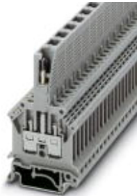
Component connector, Number of positions: 1, Color: gray

Please be informed that the data shown in this PDF Document is generated from our Online Catalog. Please find the complete data in the user's documentation. Our General Terms of Use for Downloads are valid ( http://download.phoenixcontact.com )