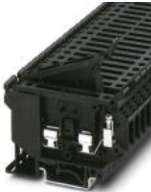
Fuse terminal block for cartridge fuse insert, cross section: 0.2 - 4 mm 2 , AWG: 26 - 10, width: 8.2 mm, color: black

Please be informed that the data shown in this PDF Document is generated from our Online Catalog. Please find the complete data in the user's documentation. Our General Terms of Use for Downloads are valid ( http://download.phoenixcontact.com )