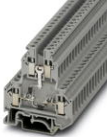
Component terminal block, Connection method: Screw connection, Cross section: 0.2 mm 2 - 4 mm 2 , AWG: 24 - 12, Width: 6.2 mm, Color: gray, Mounting type: NS 35/7,5, NS 35/15, NS 32

Please be informed that the data shown in this PDF Document is generated from our Online Catalog. Please find the complete data in the user's documentation. Our General Terms of Use for Downloads are valid ( http://download.phoenixcontact.com )