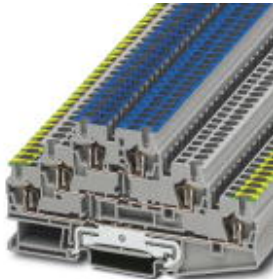
Feed-through terminal block, Cross section: 0.08 mm 2 - 4 mm 2 , AWG: 28 - 12, Connection type: Spring-cage connection, Width: 5.2 mm, Color: gray, Mounting type: NS 35/7,5, NS 35/15

Please be informed that the data shown in this PDF Document is generated from our Online Catalog. Please find the complete data in the user's documentation. Our General Terms of Use for Downloads are valid ( http://download.phoenixcontact.com )