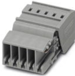
Coupling, Connection method: Spring-cage connection, Number of positions: 2, Cross section: 0.08 mm 2 - 4 mm 2 , AWG: 28 - 12, Width: 10.4 mm, Height: 18.8 mm, Color: gray

Please be informed that the data shown in this PDF Document is generated from our Online Catalog. Please find the complete data in the user's documentation. Our General Terms of Use for Downloads are valid ( http://download.phoenixcontact.com )