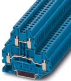
Double-level terminal block, Cross section: 0.14 mm 2 - 4 mm 2 , AWG: 26 - 12, Connection type: Screw connection, Width: 5.2 mm, Color: blue, Mounting type: NS 35/7,5, NS 35/15

Please be informed that the data shown in this PDF Document is generated from our Online Catalog. Please find the complete data in the user's documentation. Our General Terms of Use for Downloads are valid ( http://download.phoenixcontact.com )