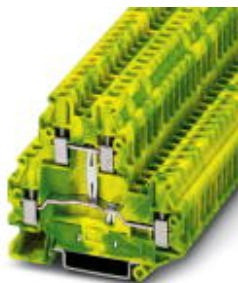
Feed-through terminal block, Cross section: 0.14 mm 2 - 6 mm 2 , AWG: 26 - 10, Connection type: Screw connection, Width: 6.2 mm, Color: green-yellow, Mounting type: NS 35/7,5, NS 35/15

Please be informed that the data shown in this PDF Document is generated from our Online Catalog. Please find the complete data in the user's documentation. Our General Terms of Use for Downloads are valid ( http://download.phoenixcontact.com )